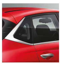
Chrome beltline with flyback rear quarter glass