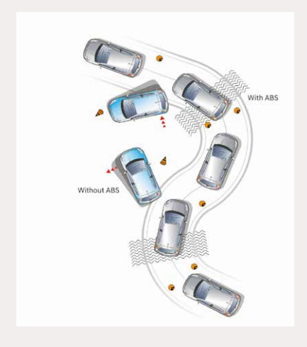
Anti-lock Braking System (ABS) with EBD