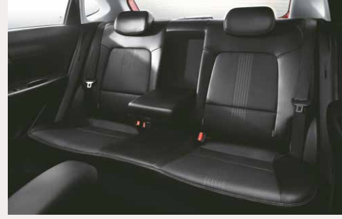
Rear seat armrest

Step inside and get entranced by its exquisitely appointed, sporty black interiors with colour inserts. Relish the premium ambience every time you take it for a spin.