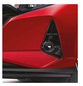
Front Projector Fog Lamps