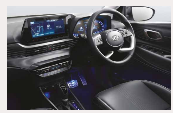
Sporty black interiors with copper inserts